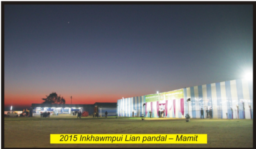
2015 Inkhawmpui Lian pandal – Mamit