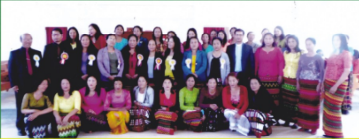
Khuangleng Bial Hmeichhe Inkhawmpui