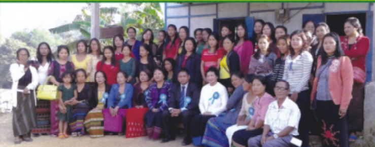
Sangau Bial Hmeichhe Inkhawmpui