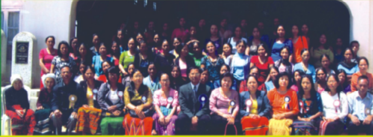
Chawngtlai Bial Leadership training leh Kristian Chhungkaw campaign

Postal Regn. No. MZR/ 53/ 2012 - 2014 RNI Regn. 40876/ 88