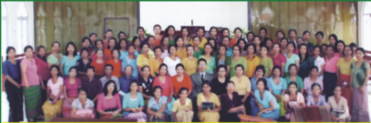
Keitum Pastor Bial Hmeichhia Kristian Chhungkaw Seminar

Postal Regn. No. MZR/ 53/ 2012 - 2014 RNI Regn. 40876/ 88