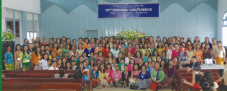
PWF 15 th Biennial Conference, Lamka, Manipur