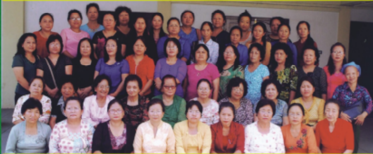
Kulkawn Bial Kohran Hmeichhia Leadership Training