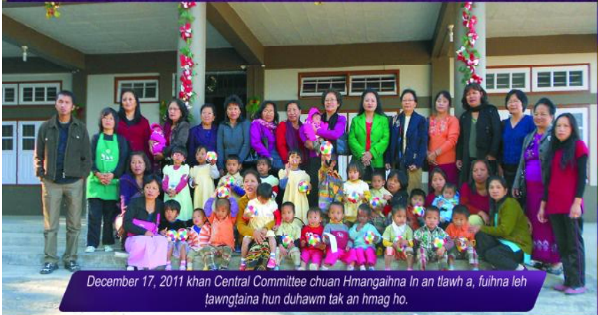
December 17, 2011 khan Central Committee chuan Hmangaihna In an tlawh a, fuihna leh jawnglaina hun duhawm tak an hmag ho.