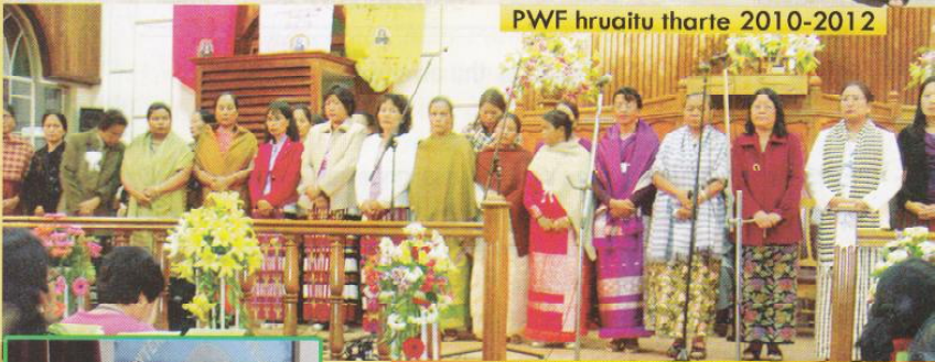
PWF hruaitu tharte 2010-2012