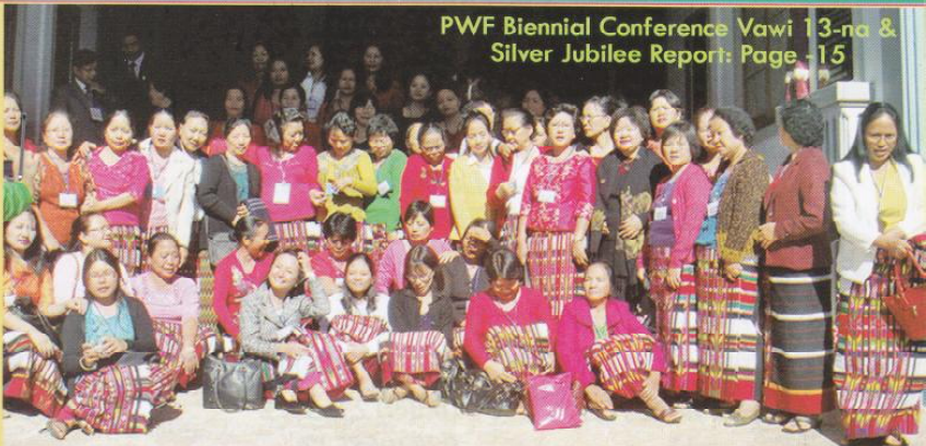
PWF Biennial Conference Vawi 13-na & Silver Jubilee Report: Page -15