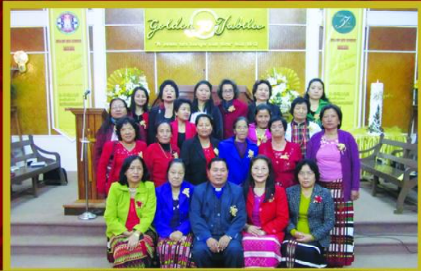
November 9-11, 2012 chung khan Shillong Mizo Kohhran Hmeichhe Golden Jubilee lawm a ni - p32