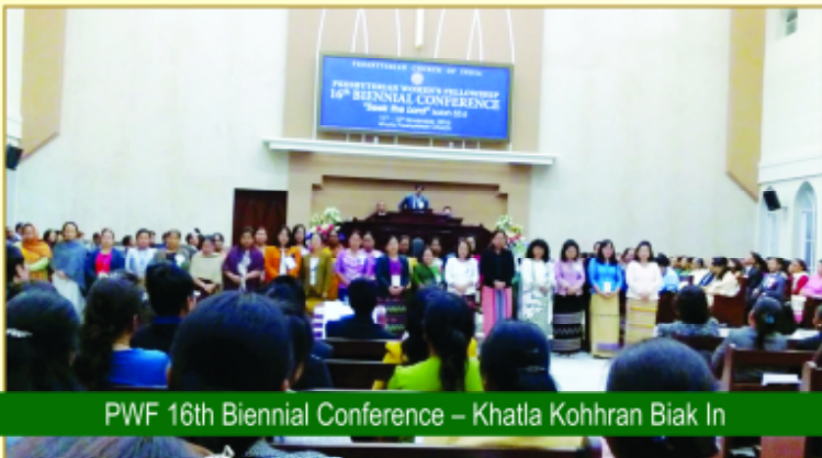
PWF 16th Biennial Conference – Khatla Kohran Biak In