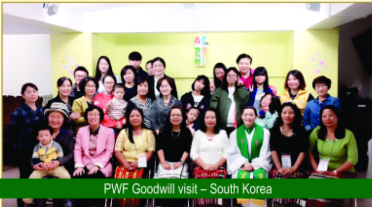
PWF Goodwill visit – South Korea

Postal Regn. No. MZR/ 53/ 2015 – 2017 RNI Regn. 40876/ 88