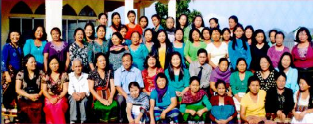
Champhai Bethel Bial Kohhran Hmeichhia Kristian Chhungkaw Campaign neih a ni