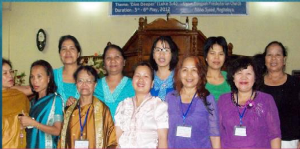
NEICCWA Hruaitute 2012 - 2014