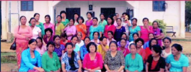
Bilkhawthlir Hmarveng Kohhran Hmeichhia Kristian Chhungkaw Campaign leh Leadership Training