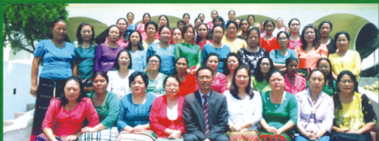
Kolasib Hmarveng Bial Leadership training leh Kristian Chhungkaw campaign