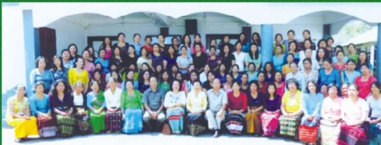
Sihphir Vengthar Bial Leadership training