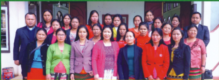
Teikhang Bial Kohhran Hmeichhe Inkhawmpui

Postal Regn. No. MZR/ 53/ 2012 - 2014 RNI Regn. 40876/ 88