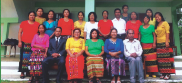
Tlabung Zodin Bial Leadership training & Kristian chungkaw campaign