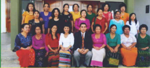
Serchhip Bial Kristian chungkaw campaign