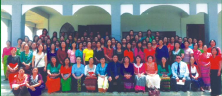
Khawhai South Bial Kohhran Hmeichhia Leadership Training & Kristian Chhungkaw Campaign