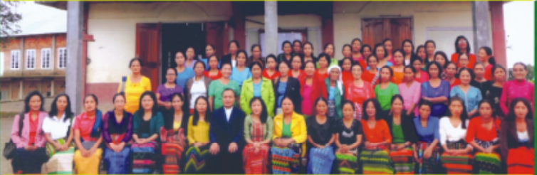
Khawlailung Bial Kohhran Hmeichhia Leadership Training & Kristian Chhungkaw Campaign