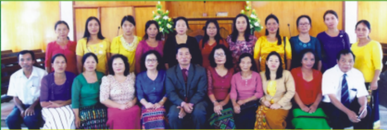
Khawhai North Bial Kohhran Hmeichhia Leadership Training & Kristian Chhungkaw Campaign

Postal Regn. No. MZR/ 53/ 2012 - 2014 RNI Regn. 40876/ 88