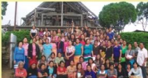
August 5 - 7, 2011 khan Kelkang Bialah Leadership Training leh Kristian chungkaw campaign neih a ni.