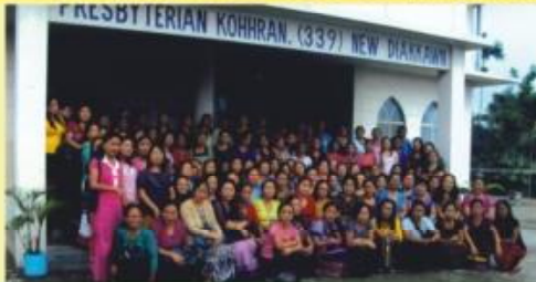
July 1 - 3, 2011 khan New Diakkawn Bialah Leadership Training leh Kristian chungkaw campaign neih a ni.