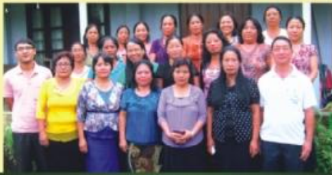
August 6-7, 2011 khan Khawzawl Vengthar Bialah Leadership Training leh Kristian chungkaw campaign neih a ni.