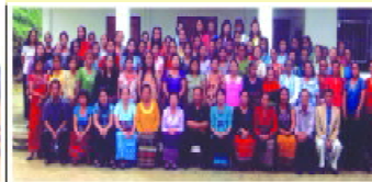
July 29 - 31, 2011 khan Sielsuk Bialah Leadership Training leh Kristian chungkaw campaign neih a ni.