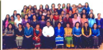
July 16, 2011 ni leng khan Mission Vengthiang Bialah Leadership Training neih a ni.