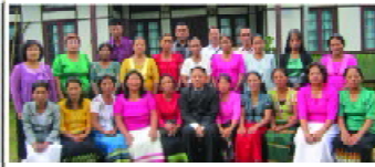
June 24 - 26, 2011 khan Darlung Bialah Leadership Training leh Kristian chungkaw campaign neih a ni.