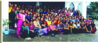
July 1 - 3, 2011 khan Kolasib Diakkawn Bialah Leadership Training leh Kristian chungkaw campaign neih a ni.