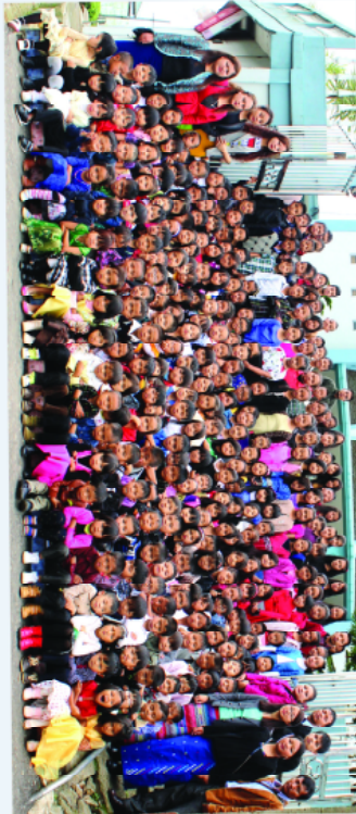
Champhat Kohrawt Kohhran Naupang Inkhawm