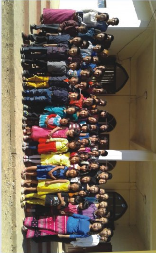
Naupang Chawhnu Inkhawm - Khawlian Kohhran