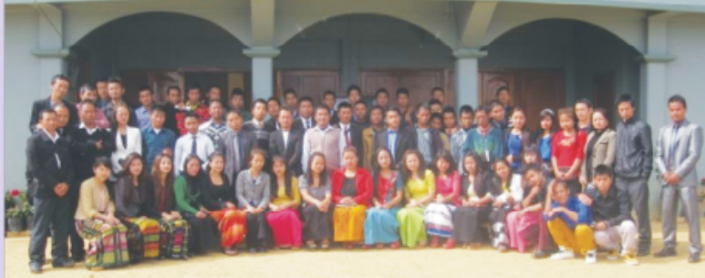
Kantu : Hliappui Branch