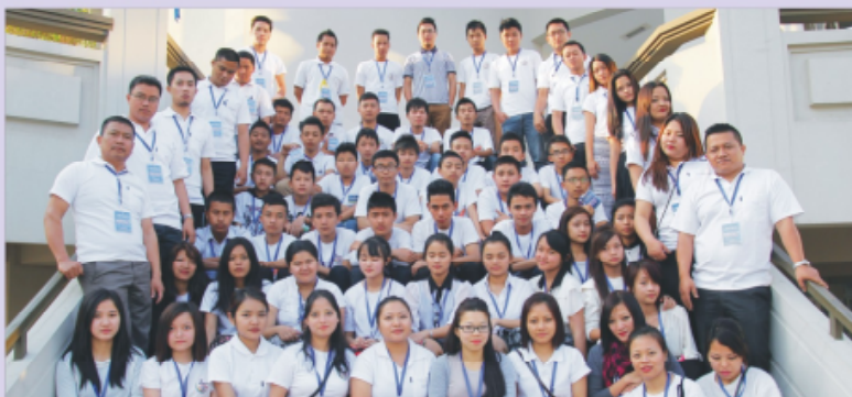
Rorel Inkhawm : Mikhual buaipuitute