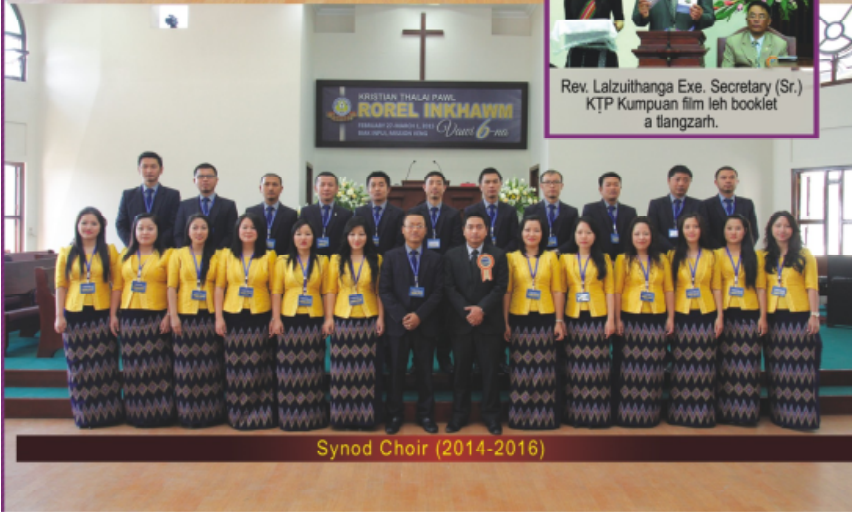
Synod Choir (2014-2016)