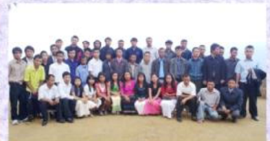
Kantu - Rabung Branch