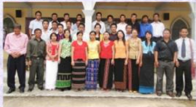
Kantu - Aibawk Branch