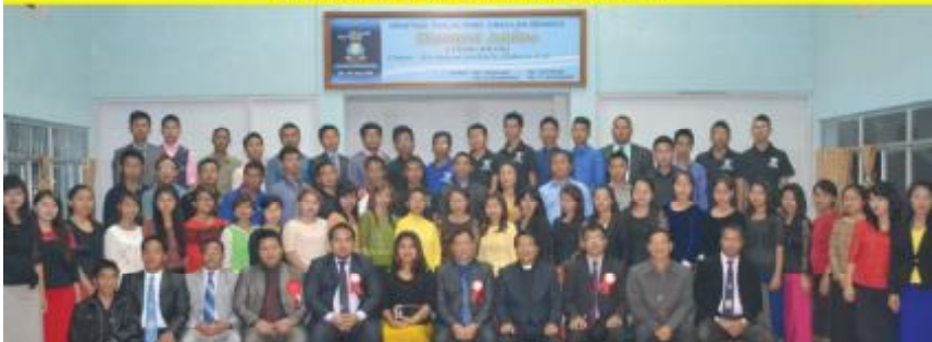
Hnahlan Branch Diamond Jubilee