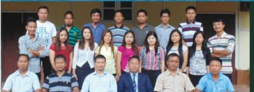
Mualpai Bethel Branch KTP Leadership training – 25.6.2016