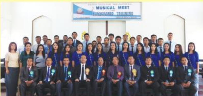
Sihfa Bial K.T.P. Musical Meet cum Leadership training – 3-5.6.2016