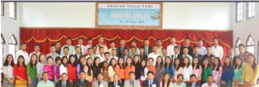
Sialhawk Branch Diamond Jubilee

Kristian Thalai Pawl Chanchinbu thla tin chhuak