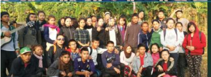
Kantu : Muallungthu Branch