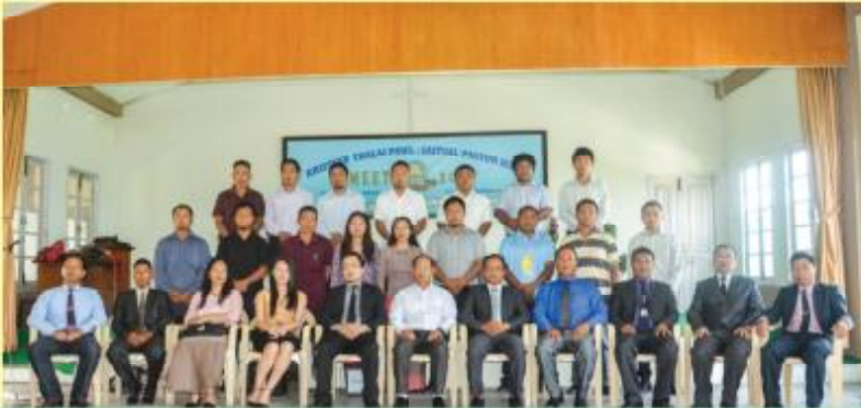
Saitul Bial K.T.P. Meet – 3 – 5.6.2016