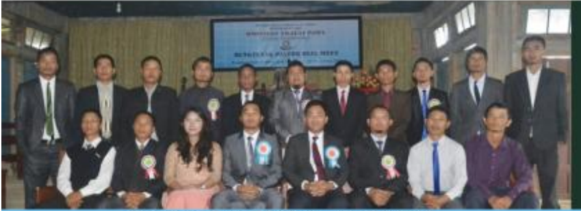
Bungtlang Bial KTP Meet – 10-12.6.2016

Postal Regn. no. MZR/81/2015-2017 RNI No. MIZMIZ/2009/29074