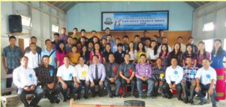
Hnahlan Bial K.T.P. Half Yearly Meet cum Leadership training – 3-5.6.2016