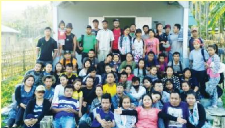
Vairengte Bial K.T.P. Work Camp @ Kalahore