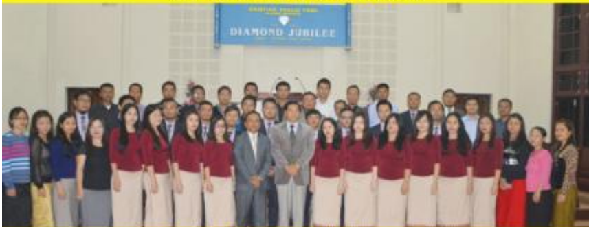
Hlimen Branch Diamond Jubilee