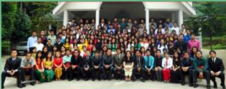
Kantu - Shillong Branch