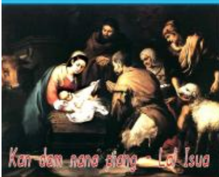
Kan dem nana siang - Lal Isua