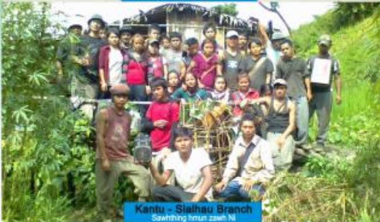
Kantu - Sialhau Branch Sawshing imin zawn A