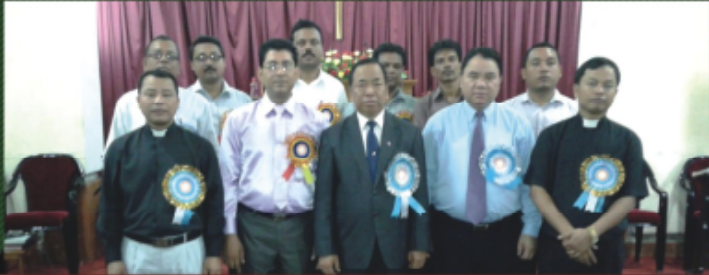
Kolkata Mission Field Thalai Conference-ah CKTP Leader