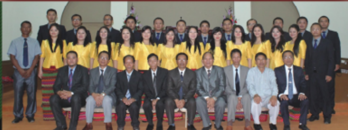
Kolasib Electric Veng Kohhran Fakna Inkhawm