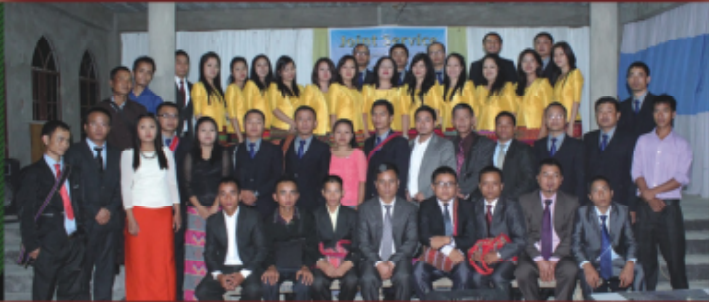
CKTP hruaitu, Synod Choir-te Sevenphul Kohhranah