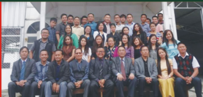
Kohima Bial Leadership training