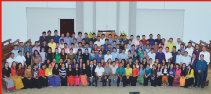
Kantu – Serchhip Kawnpui Branch K.T.P.