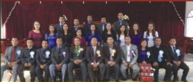
Sialsuk Branch Diamond Jubilee

Postal Regn. no. MZR/81/2015-2017 RNI No. MIZMIZ/2009/29074