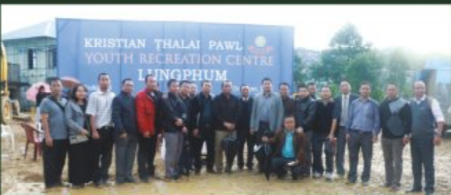
YRC lungphum CKTP hruaitu tanglaite leh hruaitu hluite