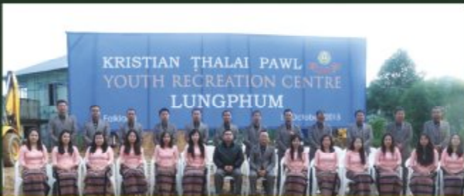
YRC lungphumah Synod Choir