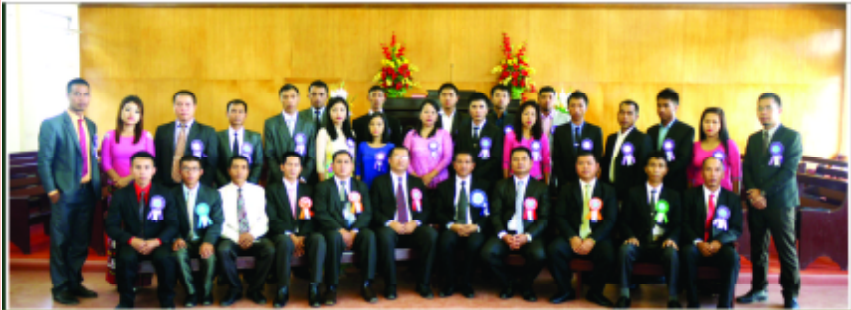
Lungpho Branch Diamond Jubilee October 1 -2, 2016

Postal Regn. no. MZR/81/2015-2017 RNI No. MIZMIZ/2009/29074