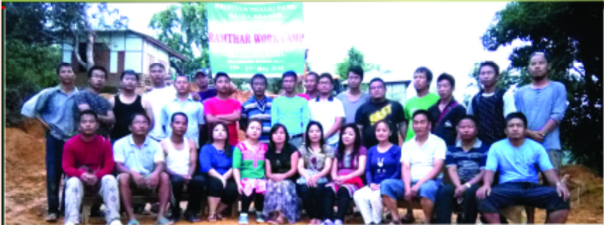
Saiha Branch Work Camp @ Diblibagh