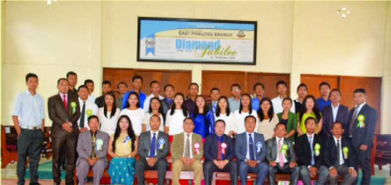
East Phaileng Branch Diamond Jubilee October 15 -16, 2016