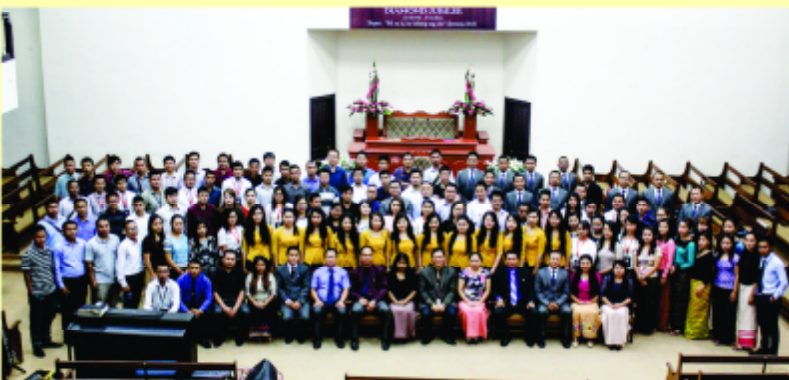
Venghnuai Branch Diamond Jubilee October 17, 2016