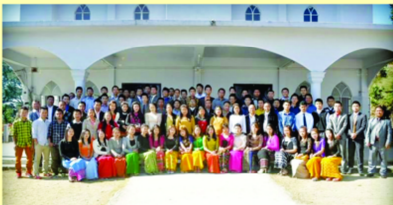
Kantu: Kawnpui Venglai Branch