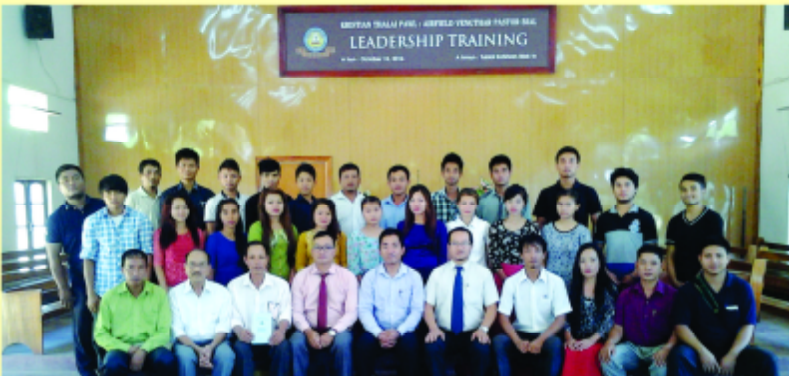
Airfield Vengthar Leadership Training October 15, 2016