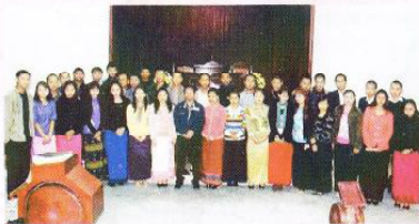
Kantu - Tuikual South Branch