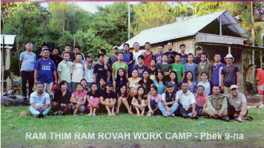
RAM THIM RAM ROVAH WORK CAMP - Phek 9-na