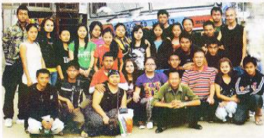
Kantu - Chawnpui Vengthlang Branch