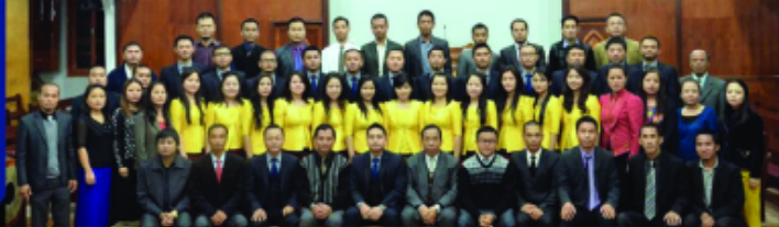
Kanan Branch Silver Jubilee - November ni 17, 2014