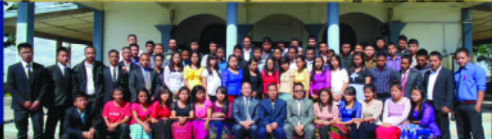
Ruallung Branch Diamond Jubilee - November ni 3-9, 2014