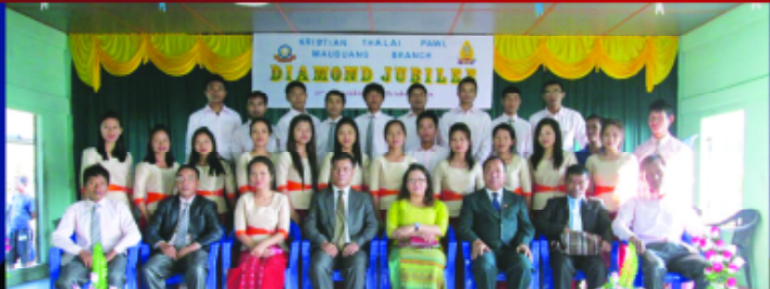
Maubuang Branch Diamond Jubilee - October ni 3, 2014

Postal Regn. no. MZR/81/2015-2017 RNI No. MIZMIZ/2009/29074