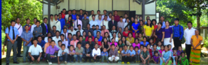
Tuipuibari Work Camp - Khawzawl Vengsang Branch