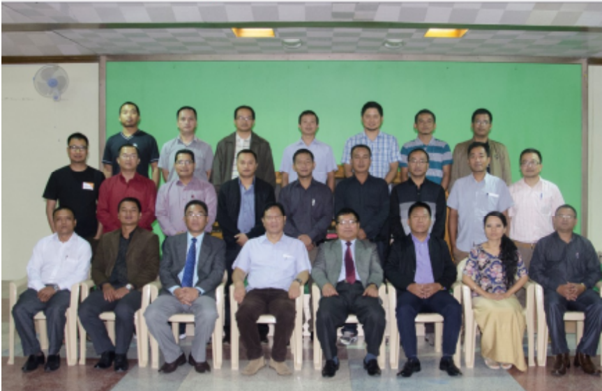
CKTP Orientation - cum - Retreat

Kristian Thalai Pawl Chanchinbu thla tin chhuak