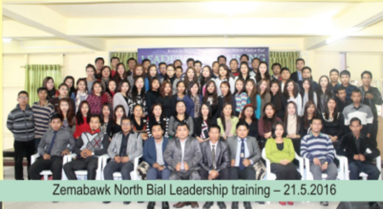
Zemabawk North Bial Leadership training – 21.5.2016