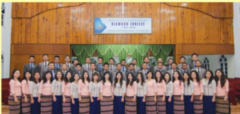
Durtlang Bial K.T.P. Diamond Jubilee – 27 – 29.5.2016