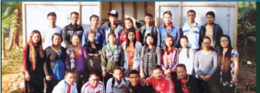
Salem Branch Work Camp @ Khahchangpara