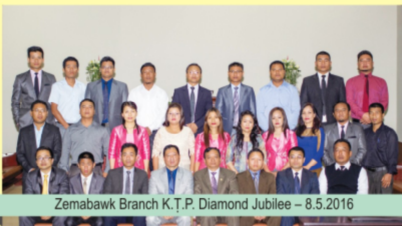
Zemabawk Branch K.T.P. Diamond Jubilee – 8.5.2016