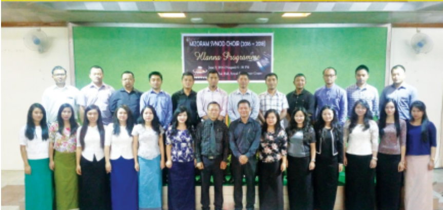
Mizoram Synod Choir (2016 – 2018)