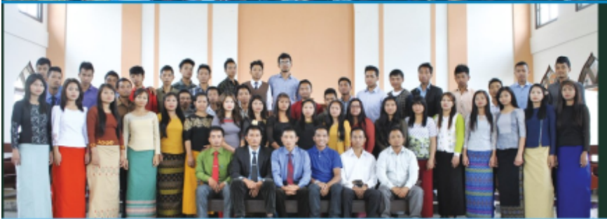
Kantu : Mualveng Branch