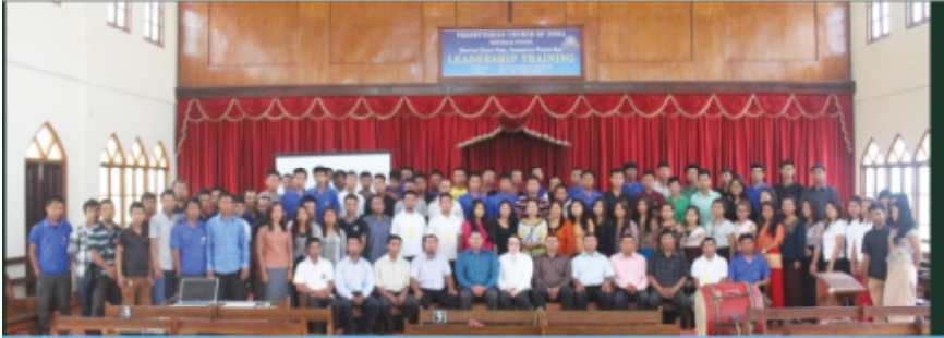
Chawngtlai Bial Leadership Training (26-27.5.2016)

Postal Regn. no. MZR/81/2015-2017 RNI No. MIZMIZ/2009/29074