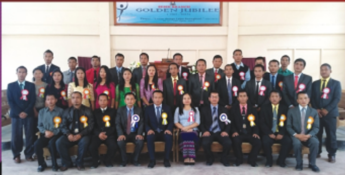
Sesih Branch Golden Jubilee

Postal Regn. no. MZR/81/2015-2017 RNI No. MIZMIZ/2009/29074