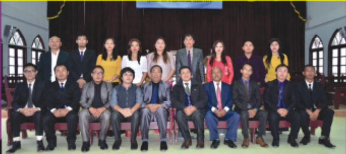
Tanhriil Vengthar Branch Silver Jubilee