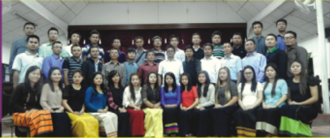
Kantu : Mamit Field Veng Branch