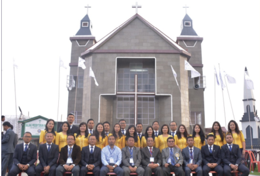
42 nd PCI Biennial Assembly, Mawsynram