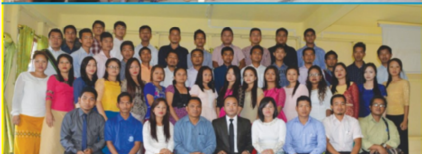
Kantu : Zemabawk East Branch