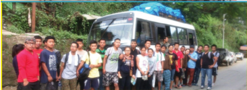
Thuampui Bial Work Camp @ Pailapool