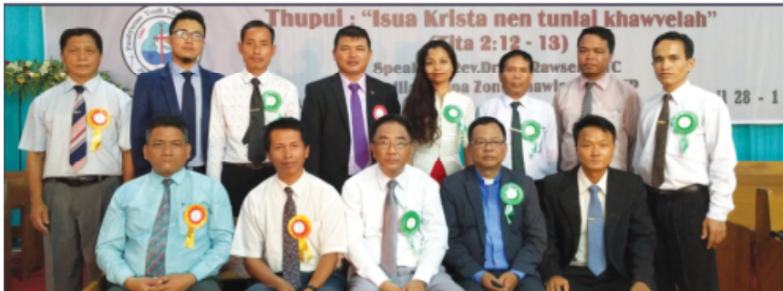
PYJC 10th Triennial Conference

Kristian Thalai Pawl Chanchinbu thla tin chhuak