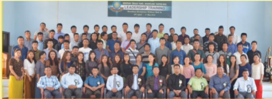
Ruantlang Bial Leadership Training (1.5.2016)

Postal Regn. no. MZR/81/2015-2017 RNI No. MIZMIZ/2009/29074