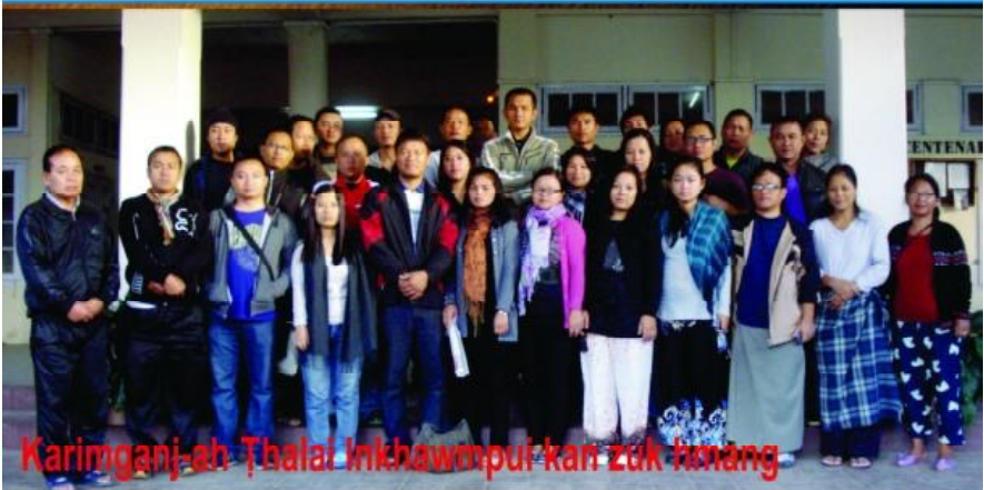
Karinganj-ah Thalai Inkhawmpui kan zuk hmang