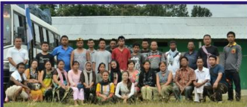
Work Camp - Ramhlun Vengthar Branch