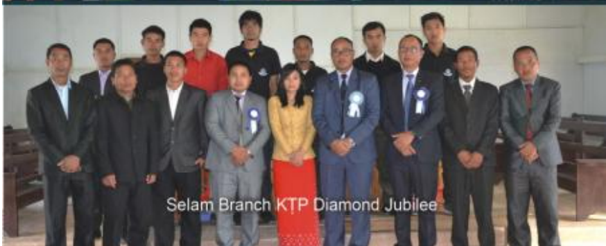
Selam Branch KTP Diamond Jubilee