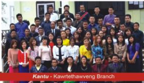
Kantu - Kawrthawveng Branch