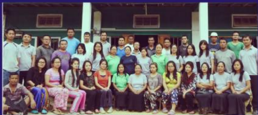
Work Camp - Republic Bial KTP