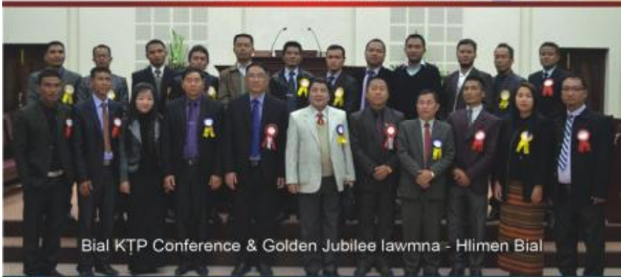
Bial KTP Conference & Golden Jubilee lawmna - Hlimen Bial