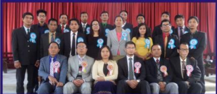
Bial KṚP Conference - Hortoki Bial