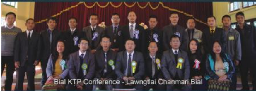
Bial KTP Conference - Lawngtlai Chanmari Bial