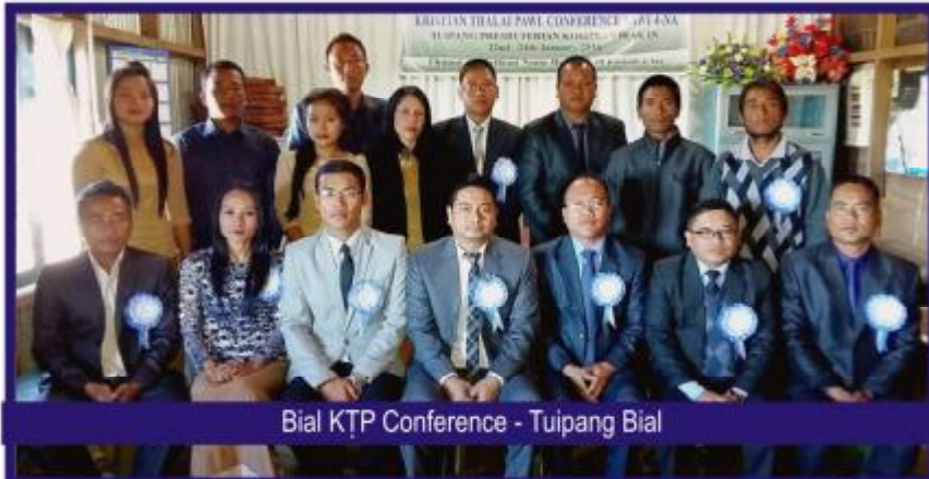
Bial KṚP Conference - Tuipang Bial