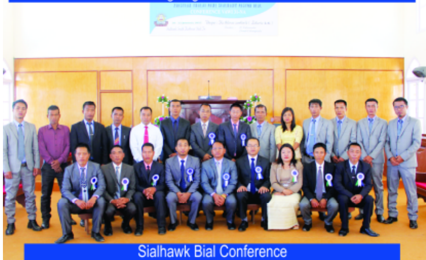
Sialhawk Bial Conference