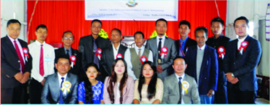
Tawipui North II Bial Conference

Postal Regn. no. MZR/81/2015-2017 RNI No. MIZMIZ/2009/29074