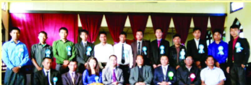
Pukzing Bial Conference