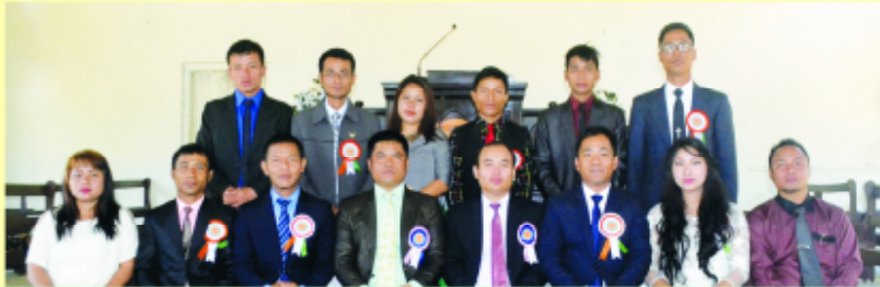
Suarhliap Bial Conference