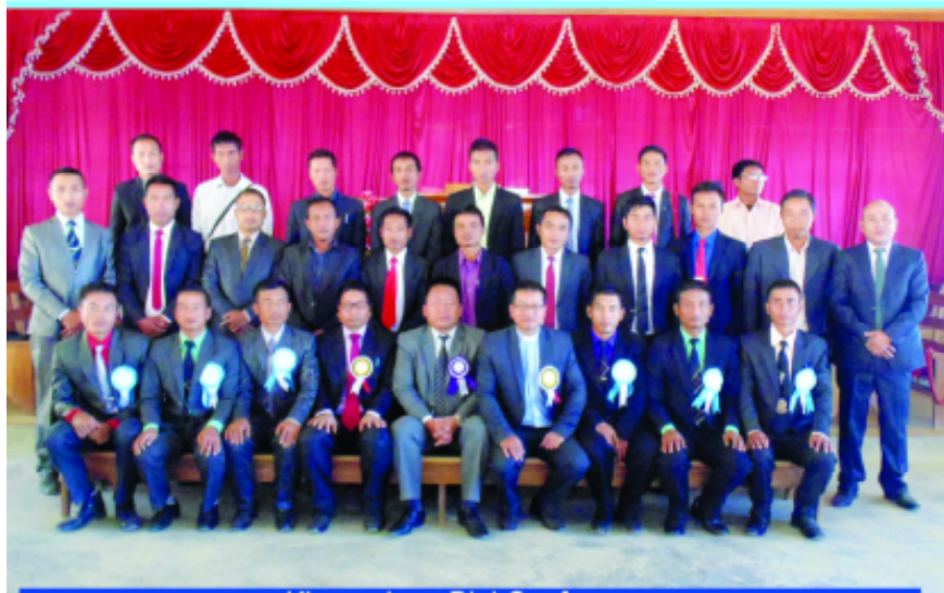
Khuangleng Bial Conference

Kristian Thalal Pawl Chanchinbu thla tin chhuak