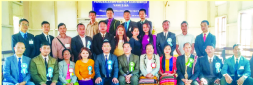
Pangbalkawn Bial Conference