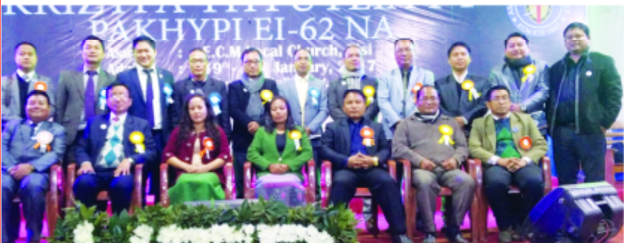
ECM KTP Conference