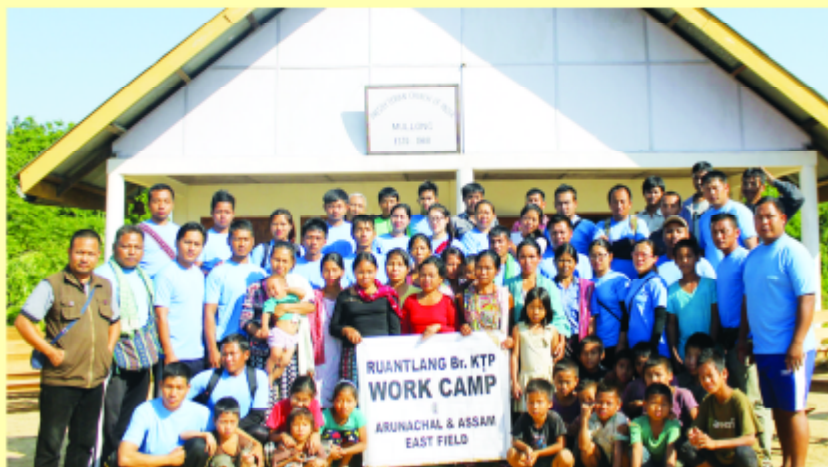
Ruantlang Branch workcamp @ Mullong