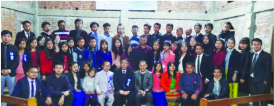
Guwahati Bial Conference