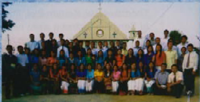
Kantu - Rûlchâwm Branch