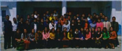
Ngopa Bial Leadership Training hmanpuin Pu Muanawma leh Pu Zotêa. training-a telte nen