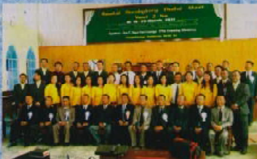
Ramlai Presbytery Meet Hruaitute, Speaker, Synod Choir leh CKTP Hruaitute