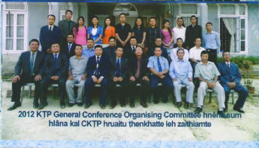
2012 KTP General Conference Organising Committee hnênsu hlâna kal CKTP hruaitu thenkhatte leh zaithiamte