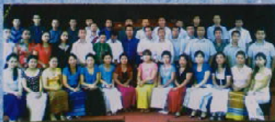
Kantu - Sairang Branch