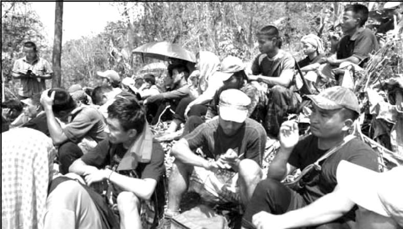
Kawnpui Bial KṚP ten Chanchin Ṭha thlenna hmasa an tlawh