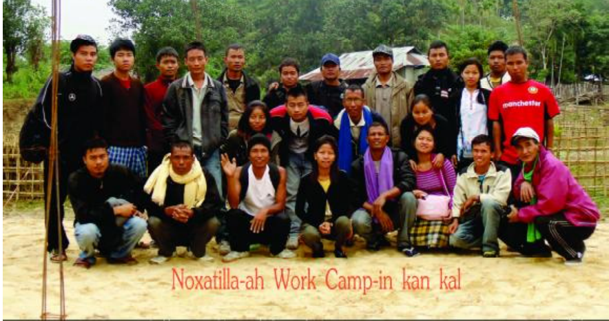
Noxatilla-ah Work Camp-in kan kal