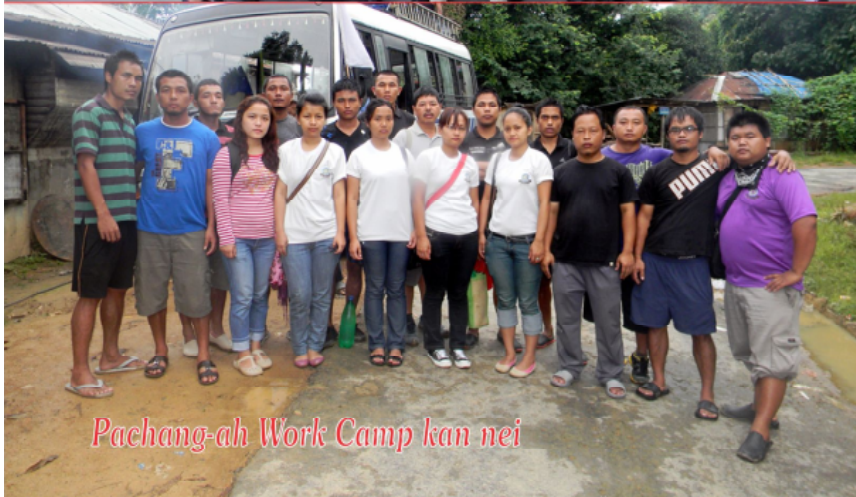
Pachang-ah Work Camp kan nei