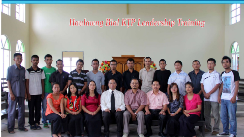
Haulawng Bial KTP Leadership Training