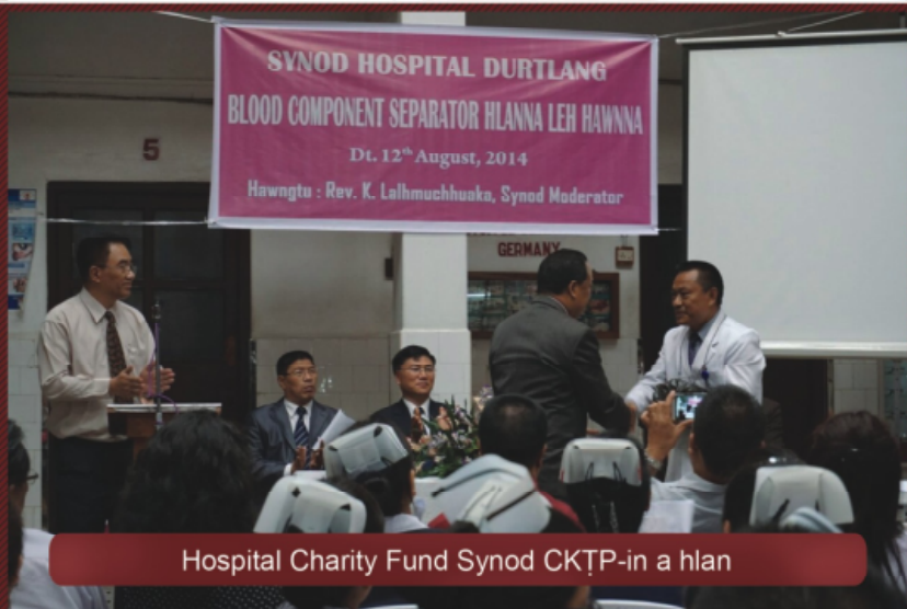
Hospital Charity Fund Synod CKTP-in a hlan