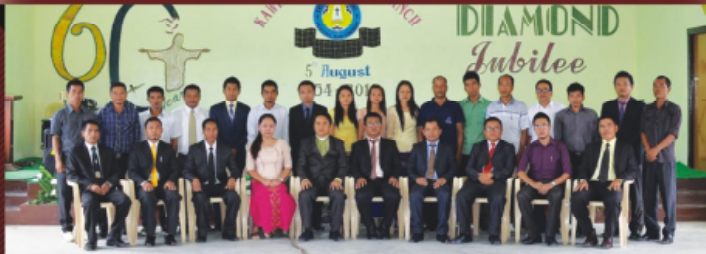
Kawrtethawveng Branch K.T.P. Diamond Jubilee