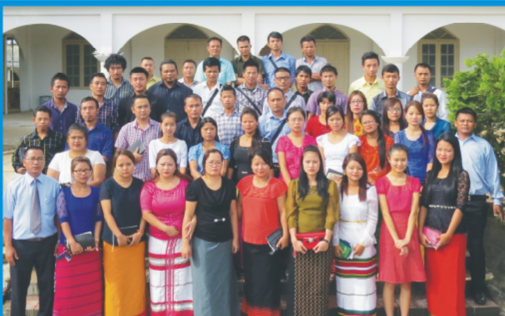
Kantu – Kolasib Hmarveng Branch K.Ṭ.P.