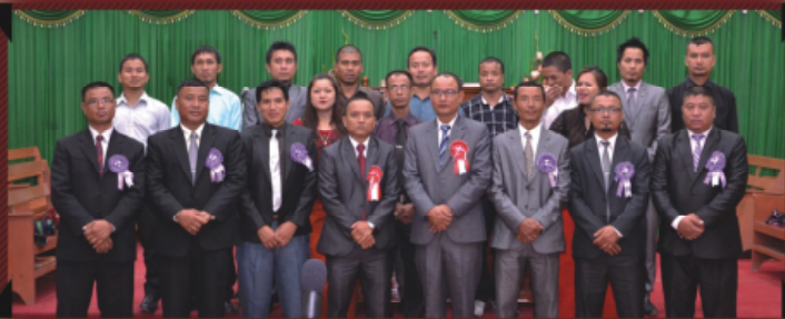
Muallungthu Bial K.T.P. Meet