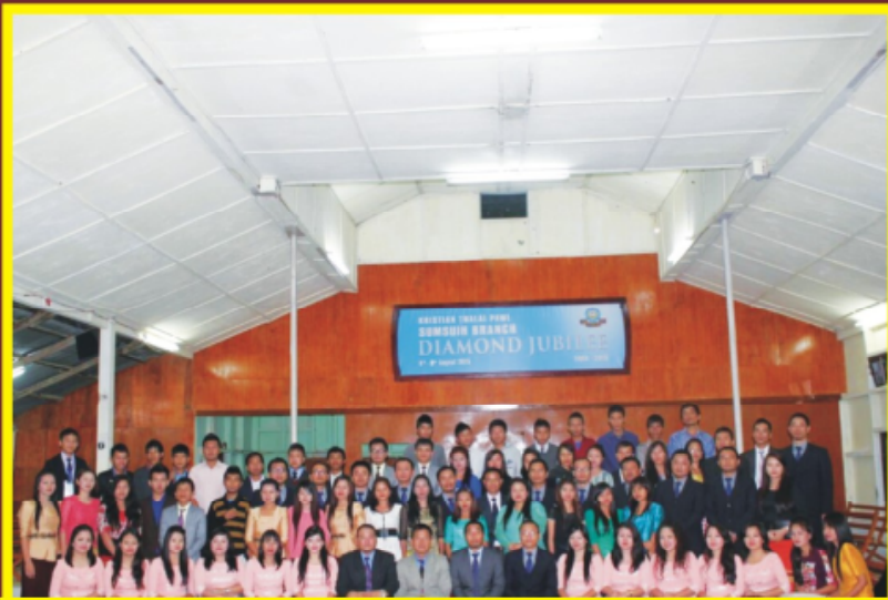
Sumsuih Branch KTP Diamond Jubilee lawmna (8.8.2015)