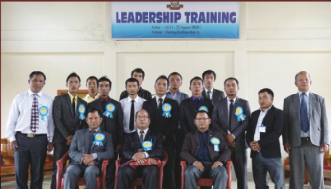
Chalrang Bial KTP Leadership Training (21.8.2015)