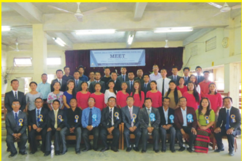
Kawnpui Chhimveng Bial Leadership Training (8.8.2015)