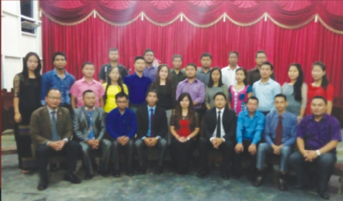
Model Branch, Lengpui-ah YRC Awareness Campaign (10.8.2015)

Postal Regn. no. MZR/81/2015-2017 RNI No. MIZMIZ/2009/29074