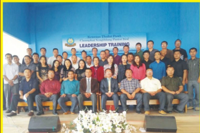
Champhai Vengthlang Bial KTP Leadership Training (7.8.2015)