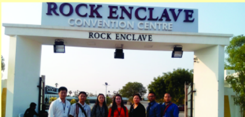
United Christian Prayers for India, Youth Leaders meeting - 12-13.5.16