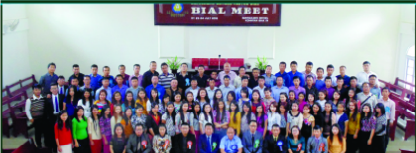
Bawngkawn Bethel Bial Leadership training & Bial Meet – 23-24.7.2016