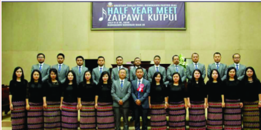
Mizoram Synod Choir tharte rawngbawlna hmasa

Kristian Thalai Pawl Chanchinbu thla tin chhuak