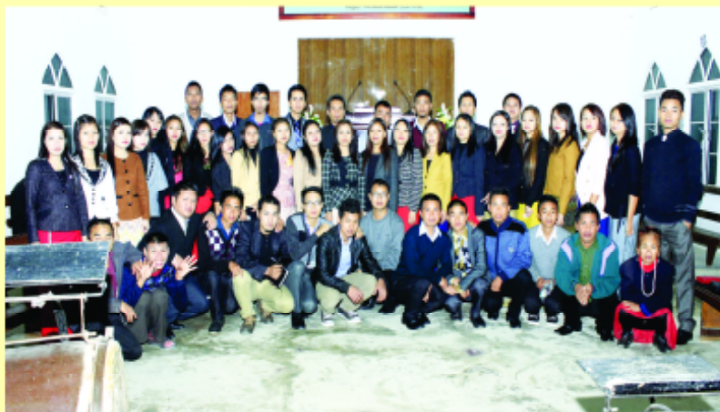
Kantu: Serchhip Bazar Branch