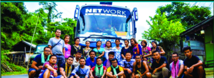
Tuikual Branch Workcamp @ Aalo & Elephant