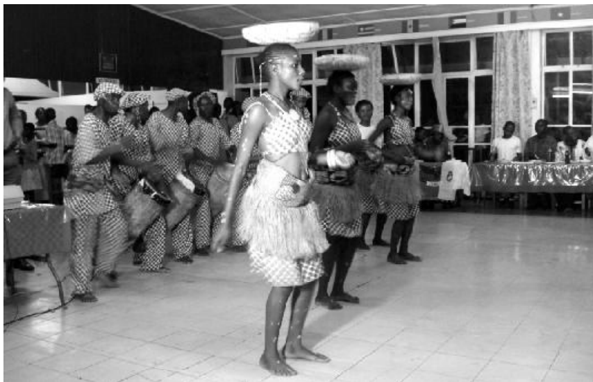
(Zambian youth performing talents dance)

Apart from all these the Face to Face Zambia 2009 has really been a blessing to me in many aspects and it has also taught me many things- the value of culture, the richness of God, the different manifestations of God through various cultures, the unity among the diversity of the people of Zambia and the participants as well, the necessity of constantly looking at the stand of the Church regarding its practices etc.