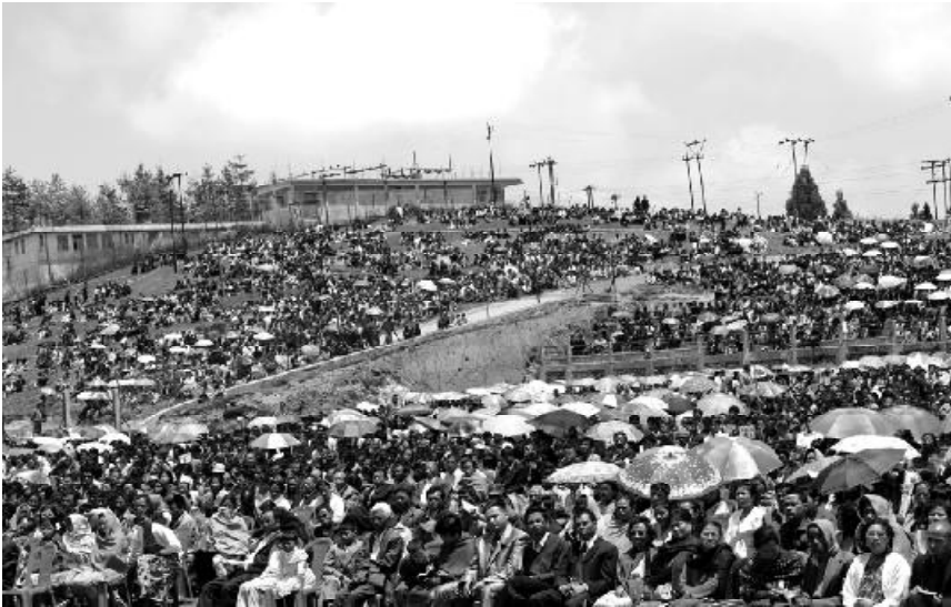
(The Crowd in the open air at the PCI General Assembly)

1) Mawngap in a big township a half hour journey from Shillong. The host church, the Mawngap Presbyterian Church, was established in 1925 bearing the name “The Welsh Presbyterian Church, Mawngap, and later it was renamed as the Mawngap Presbyterian Church. The Church building was rotunda in shape, well decorated with timber lining all over. Whereas the majority of the population is Christians,