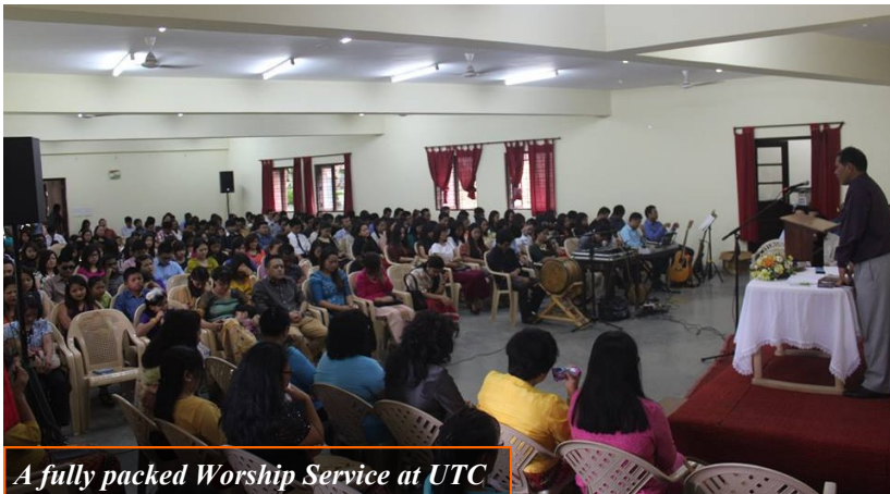
A fully packed Worship Service at UTC

It is significant to highlight that Mizo population or Diaspora Mizo grew in Bengaluru in geometric proportion, in the mid 1990s about 200 people and in 2010s about 2000 people, i.e. tenfolds growth. This fast growth of Diaspora Mizo community may be ascribed to the Bengaluru city development, employment opportunities, educational facilities and accommodative sentiments of the local people. The growth of Diaspora Mizo population is likely to continue for years because of lack of infrastructure and job opportunities for our youths in our home state. This is true in other Indian metropolitan cities too. Therefore, Mizoram Synod Conference of 2007 passed a resolution that Pastors/Ministers be stationed in Indian mega cities to cater the spiritual and ecclesial needs of our Church members and Mizo community.