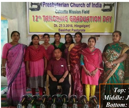
Top: Tailoring Graduates; Middle: JPM Mohila Conference; Bottom: JPM Youth Conference

Good news- Non-Formal School, Spoken English Class, Adult Education, Music class, Medical Ministry and Craft training ministry. These ministries are useful to prepare the atmosphere the localities that the gospel might be freely preached.