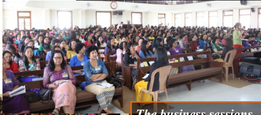
The business sessions