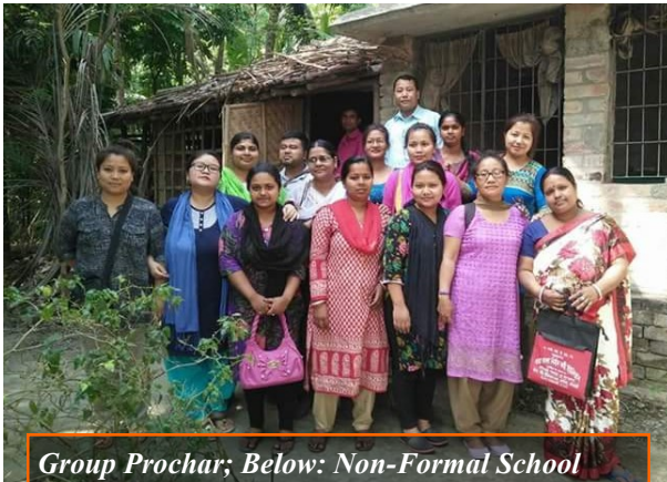
Group Prochar; Below: Non-Formal School

Direct Evangelism: It is the method of propagating the gospel by directly approaching the people in a particular area. We have 1) Group Preaching 2) Distributing Bible Tracts 3) Gospel Campaign. This is normally organized in the Fellowships and in the street 4) Personal Evangelism – counseling 5) Seeker's Rally. A person who already knew the Gospel but not yet been baptized are called Seekers; seeker's Rally is especially meant for them 6) Film Ministry. It is one of the most important means of evangelism.