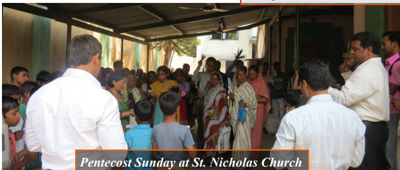
Pentecost Sunday at St. Nicholas Church

The Mohila (women) and Youth fellowship have their own guidelines and these are included in the Handbook. They elect their leaders; they do fund rising by themselves for their own affairs. They organize programmes to attract people and to strengthen members.