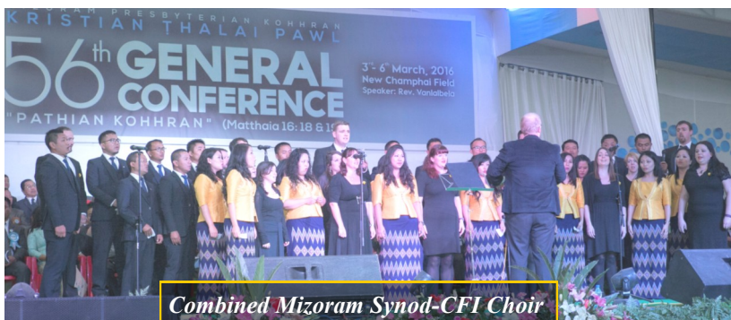
Combined Mizoram Synod-CFI Choir