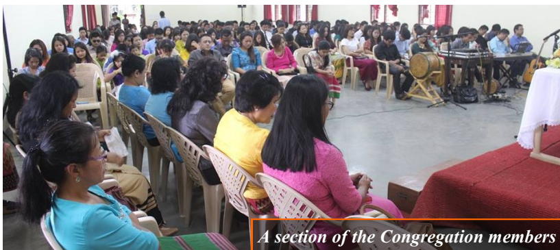
A section of the Congregation members

Out of this necessity, certain Church ministers in United Theological College and theologians and likeminded people formed Church Committee. After months of cautious move the first Church worship was held on Sunday 6 th November 2011 at Tagore Hall No.3 UTC, attended by 86 members. The establishment of Mizo Church in Bangalore was reported to the Synod Executive Committee (SEC), and the matter was taken up and then endorsed to the Synod Conference 2011. The Synod Conference decided that the Church be recognised and suitable minister be posted. The 2012 February SEC session nominated Rev. Vanlalnunmawia Zawngte for Bangalore Mizo Church Pastor. With much enthusiasm the Church welcome the new pastor on 29 th April 2012 Sunday worship service; in fact it was jubilation for the church because they ultimately have the Pastor that signifies Synod's approval of the Church. 4 Since then the church has been growing in varied and significant dimensions.