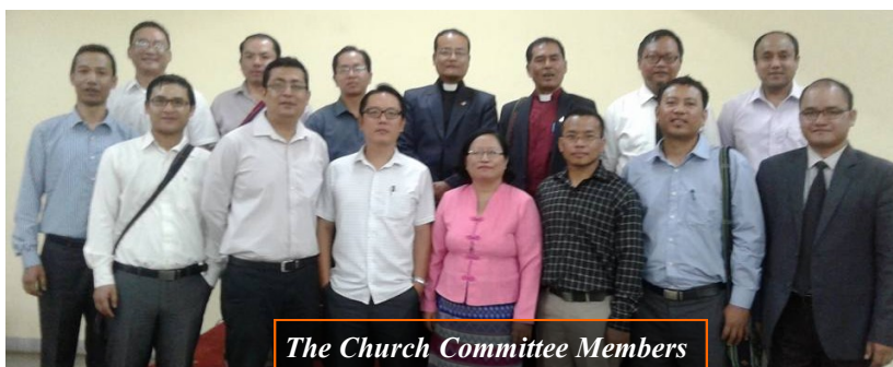
The Church Committee Members

Church Committee: With the Pastor as a Chairman, ordained ministers of the PCI and Tual Upa (elected members for three year term) constitute the Church Committee. At present five ordained ministers and six Tual Upa constitute Bangalore Mizo Church, having its meetings on every second Saturday of the month.