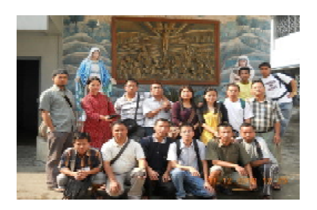
[ATC Students Volunteer at Prem Dan (Missionaries of Charity)]

Prem Dan, the house for the mentally and physically ill, is in a poor area of the city and it's surrounded by a wall to avoid any violence. On the first floor of the house there are those patients who can't walk, on the second are those who are autosufficient. They don't have much to do, the ones who are the most ill are only moved when the beds are done. and the others can go in the garden and talk between them, and are taken care of by the volunteers. It is friends and families who take there the people who need help. Sometimes it's the sisters who find sick people on the street and take them in. During our stay, there were around 180 inmates. The numbers fluctuate as there was constant moving in and out patients.