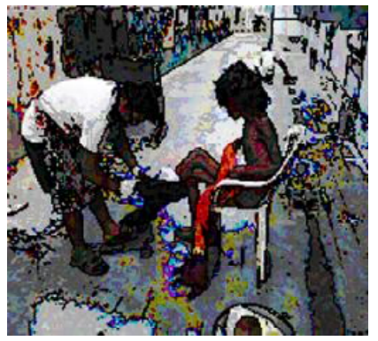
[Worker attending new inmate picked from the street at Prem Dan]

Every day between 8am – 12:00 noon we were engaged with laundry, washing clothes, washing floors, helping to feed the patients, spending time with the patients, talking to them, help to prepare the plates, passing out for lunch, cleaning all the dishes when the patients have been fed and when the dishes are finished.