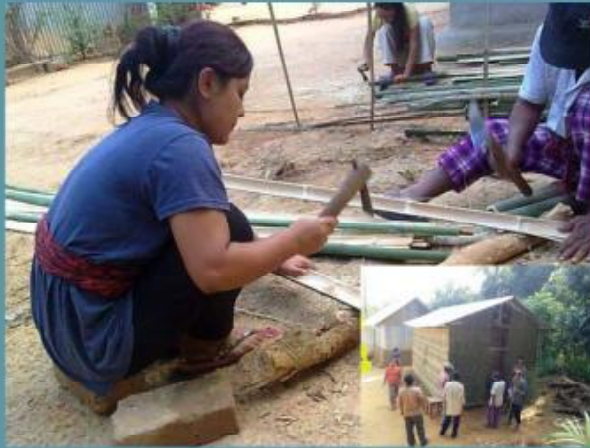
Darchoi Pastor Bial chhúnga thawktuten (Sikul lam leh Evangelist) Salbagan khuaah Joint Prachar cum Biak In sak Work Camp an nei.

Nulate pawhin thawh hreh rêng an nei lo! (A hnuai-ding lam kila mi hi an Biak In sak a ni)