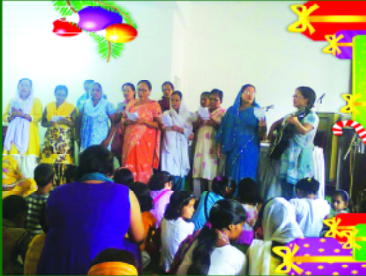
2013 - Dayal Bagh Kohhran Hmeichhia Delhi Mission Field