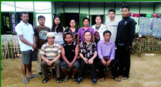
Home Mission South Parva khuaa thawktute leh kan hotute...May, 2014 Malaria a tam hle a ni