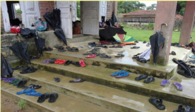
Entawntlâk Biak In chhûngah khawi kip an rahna pheikhawk an bun lût ve ngai lo. Jharkhand