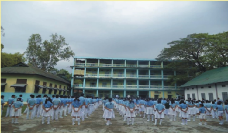
2014 ORIENTAL HIGH SCHOOL SILCHAR-BARAK AREA

Odisha-a kan thawpui, New Life Mission Church chuan Mizoram Synod inenkawlna tha an tih em avanga rawn zawm duhin, anmahni thuin 'Kui Presbyterian Church' tiin an lo invuah, thilpek rawng- bawlnaa barhvang tak an ni a, ni 30 March, 2014 Chawlni chawhma inkhawmah, Bawng 10 neitu chhungkaw pakhatin sawma-pakhat an pe.