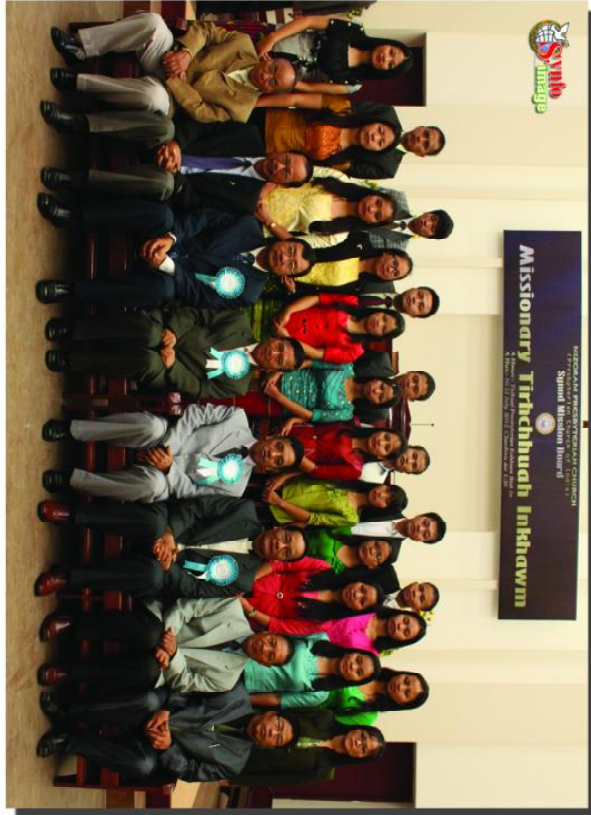
Synod Mission Board BEC Member-te Jeh Missionary tih chnuah tharte (Tuikual Kohhyan Biak In - 22 July, 2012)