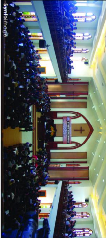
Synod Inkhampui Vawi 89-ra (2012) Chanmari Kohhran Blak In-a-Palalte rorell'ai