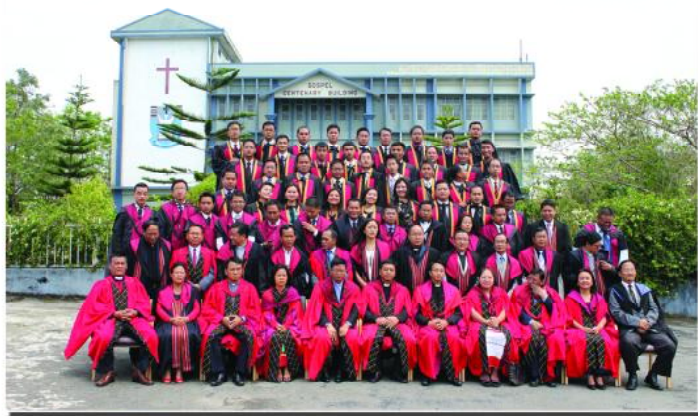
ATC Dedication cum Farewell (April 16, 2012)