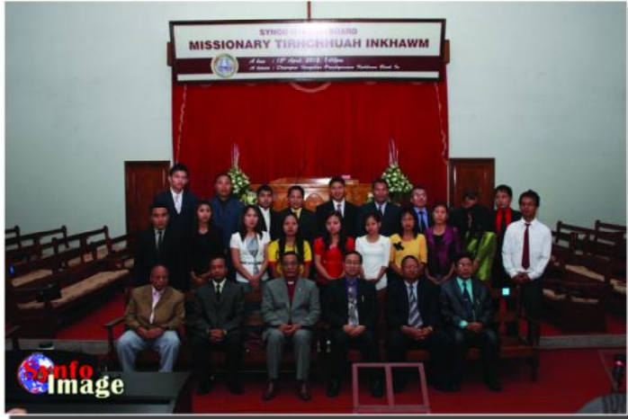
April 15, 2012-a SMB Missionary tirchchuahte leh Mission Board hotute