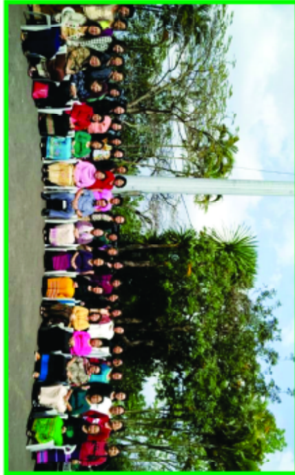
Kohhran Hmeitche hnuaitu thar retreat leh leadership training, Synod Conference Centre

Postal Regn. No. MZR/ 53/ 2015 – 2017 RNI Regn. 40876/ 88