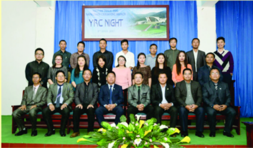
Bawngkawn ChhimVeng Branch YRC Night