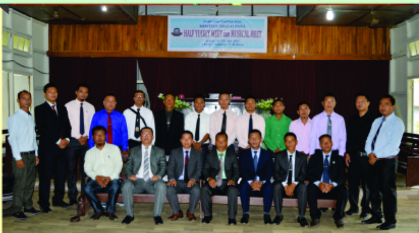
Zamuang Bial Half Yearly Meet cum Musical Meet