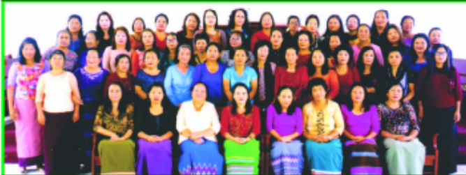
Leitan Bial Leadership training